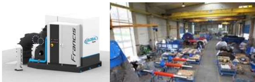
Figure 2 – Global Hydro Products and Manufacturing Facility

As a specialist in micro hydro technology, Global Hydro has developed its own SmartT technology which is an ideal product for outputs of 100kW to 1 MW per unit. SmartT power stations are fully assembled at the factory and delivered as ready-to-use power plant in 20ft containers. SmartT technology can be combined with other technologies such as solar and wind energy plus combined with battery storage for optimized operation. This low operating cost sustainable technology has no environmental impact and is therefore ideal for the Pacific regional markets, including Australia.